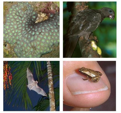
Fig. 1: 4 of the 12 Seychelles EDGE species

institutional facilities and visitor centres, attracting millions of visitors/year. These centres, many of which have experienced media personnel, will be used to advertise the project to the public, ensuring that marketing potential of the project/logo is maximised in a professional manner alongside the visually-striking images of many of the EDGE species (Figure-1). For example, partner SIF has a newlybuilt visitor centre/café/boutique on Praslin at the Vallée de Mai UNESCO World Heritage Site (with up to 60,000 visitors annually) which will advertise the Darwin project and achievements. National Museum of Seychelles resides in a prime-location in the capital that houses natural history exhibits and extensive facilities for schools/out-reach. Darwin logos will feature prominently here, on postcards, Tshirts, educational leaflets etc.