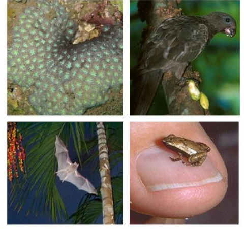
Fig. 1: 4 of the 12 Seychelles EDGE species

SEYCHELLES - an EDGE-zone: Most EDGE species are scattered globally. Remarkably, the Seychelles islands in Indian Ocean are home to no less than 12 currently the